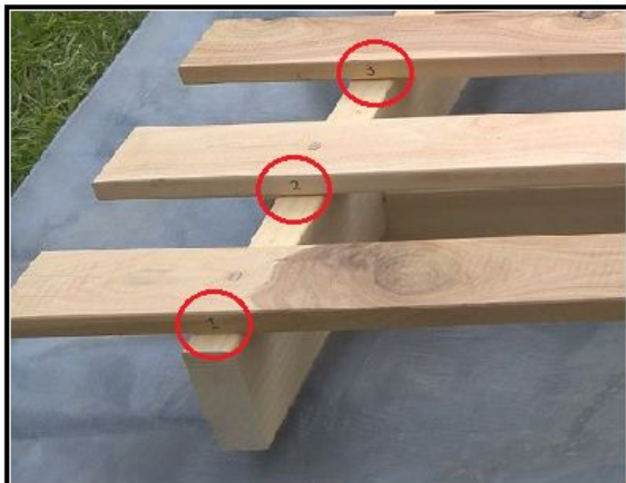
Photo 3: Place the slats in order from slat number "1" through to slat number "15"

Important: Place the first slat labelled "1" over the number "1" (refer photo 2)